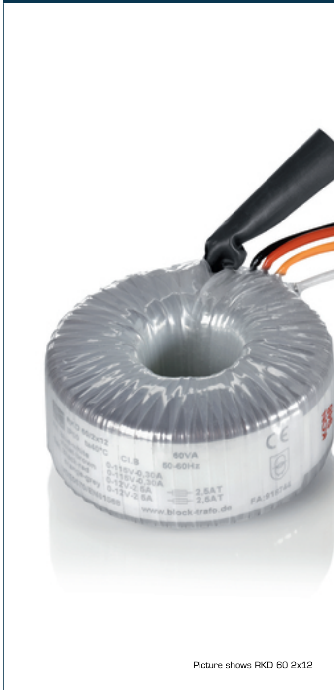
Picture shows RKD 60 2x12